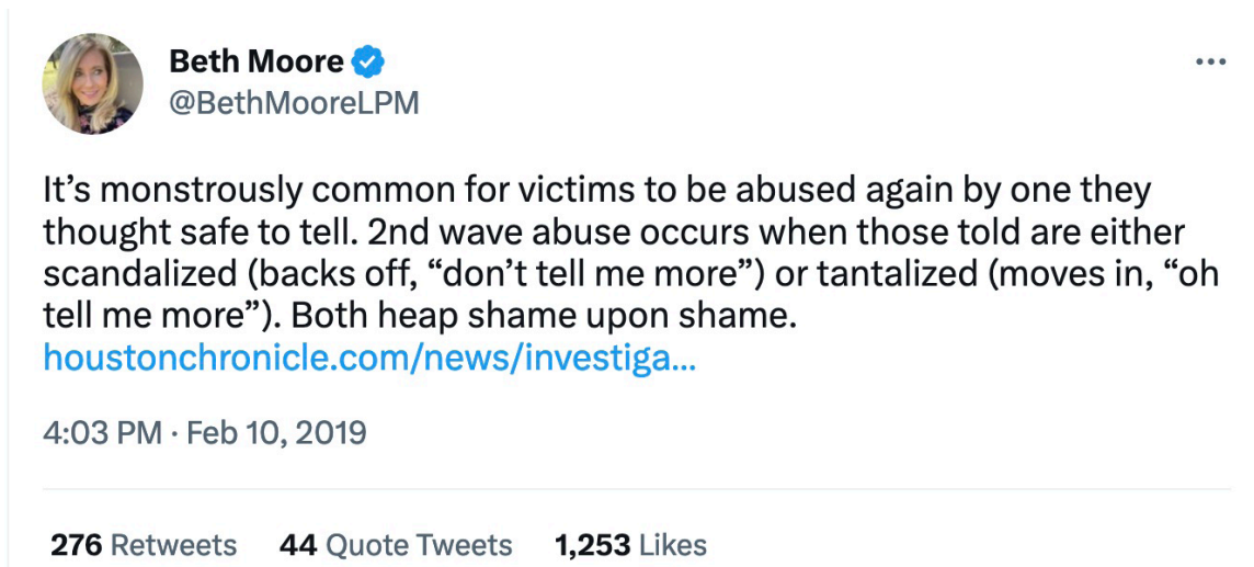
Figure 2: Moore’s Tweet from February 10, 2019, which is her response to the Abuse of Faith report from the Houston Chronicle. The article is linked in her Tweet. Text: “It’s monstrously common for victims to be abused again by one they thought safe to tell. 2nd wave abuse occurs when those told are either scandalized (backs off, ‘don’t tell me more’) or tantalized (moves in, ‘oh tell me more’). Both heap shame upon shame.”