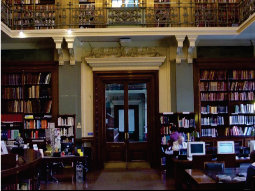
Figure 4.1. Victoria and Albert Museum in London.

the V&A special collection for an article I was writing (see Figure 4.1). To put it more simply, I was conducting a kind of humanities research in a very conventional way—identifying a purpose, tracing textual sources in a sanctioned library, drafting and revising. (Research in other fields takes various forms, of course, including field work and lab work.)