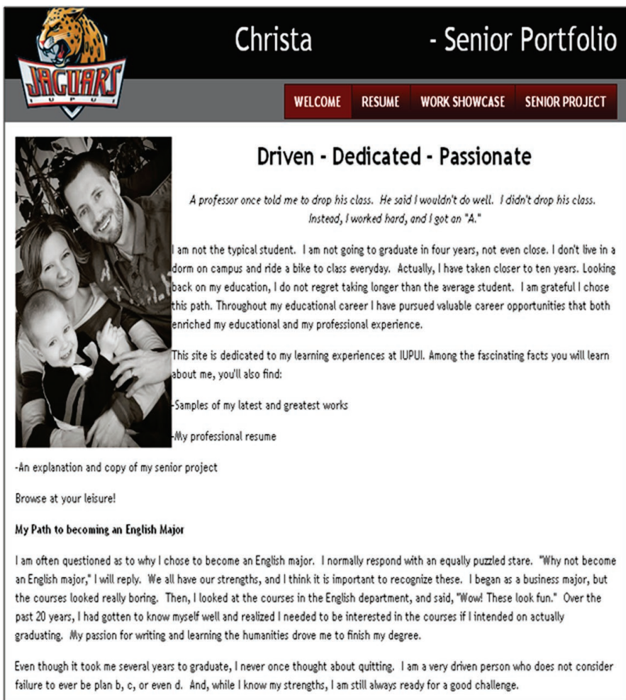
Figure 3. Webfolio Screen Shot 2.