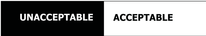
Figure 1: The ethics of using others' texts—the simplistic view.

tween “the property side” (the author’s or creator’s side) and “the use side” (the user’s side, the social good side):