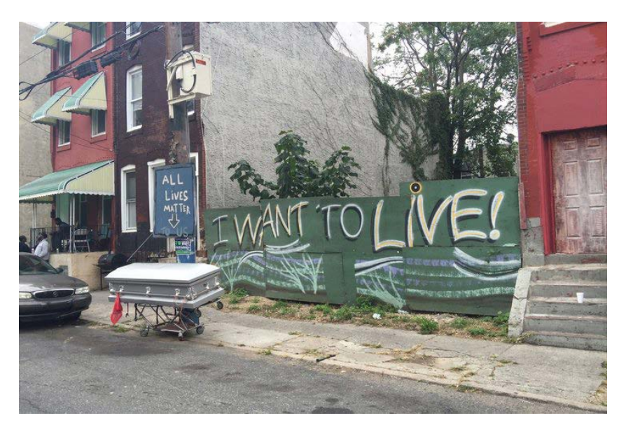
Figure 1: Rowhouse displays outside of North Philadelphia's Urban Crisis Response Center