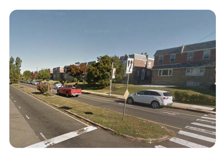
Figure 2: Northeastern Philadelphia Rowhouses

This student's analysis had to back up his position with evidence. If you were to apply the SHOWED questions to his imagery, how would