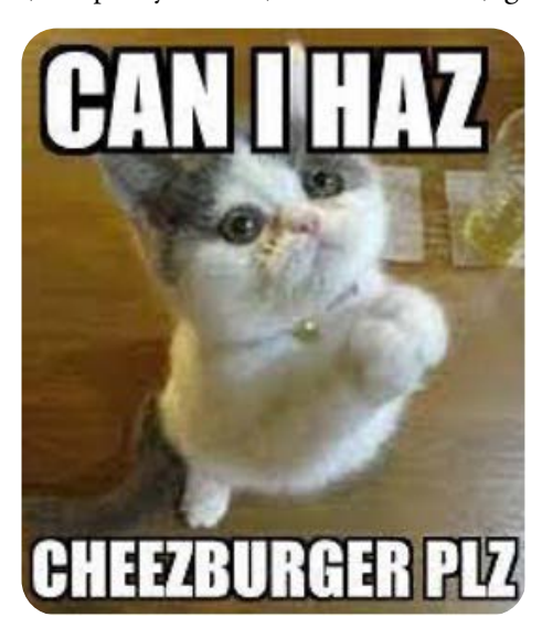
Figure 1. An image of a small, gray and white kitten standing on its hind legs and looking up at the photographer, with the words "CAN I HAZ" placed at the top of the photo, and "CHEEZBURGER PLZ" at the bottom of the photo.

Consider the (now pretty ancient) LOLcat meme (fig. 1).