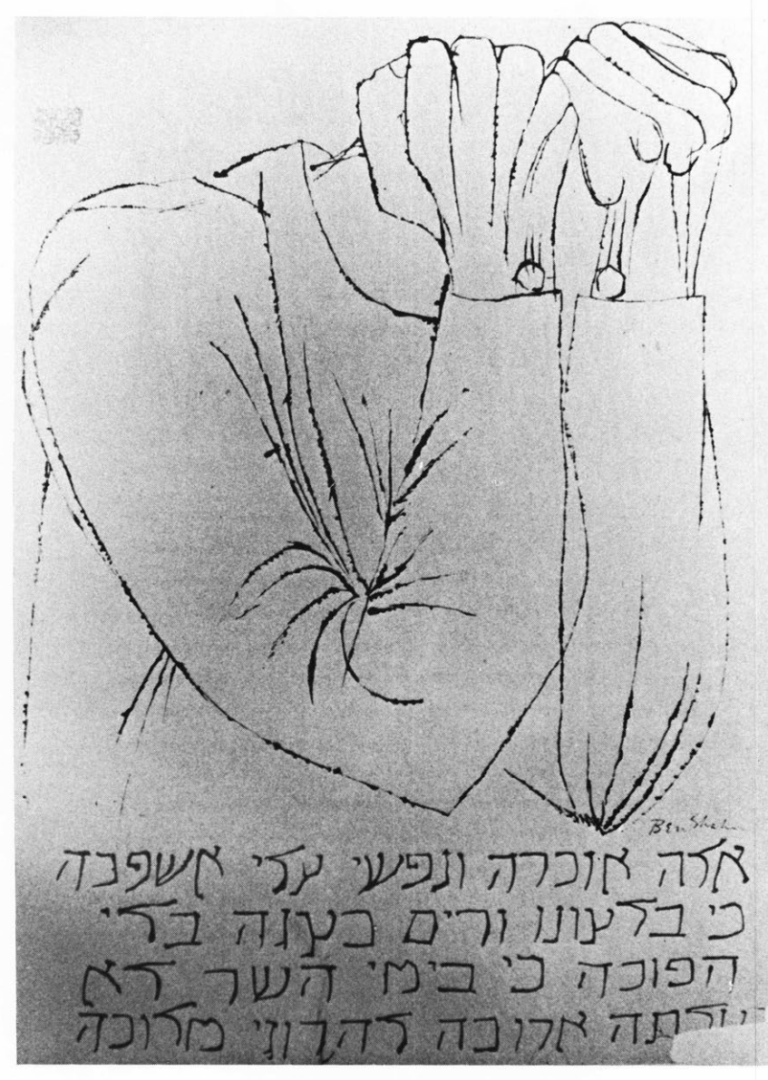
Figure 1. Warsaw 1943 by Ben Shahn 1963, Poster 36\%''~\times~28\%''